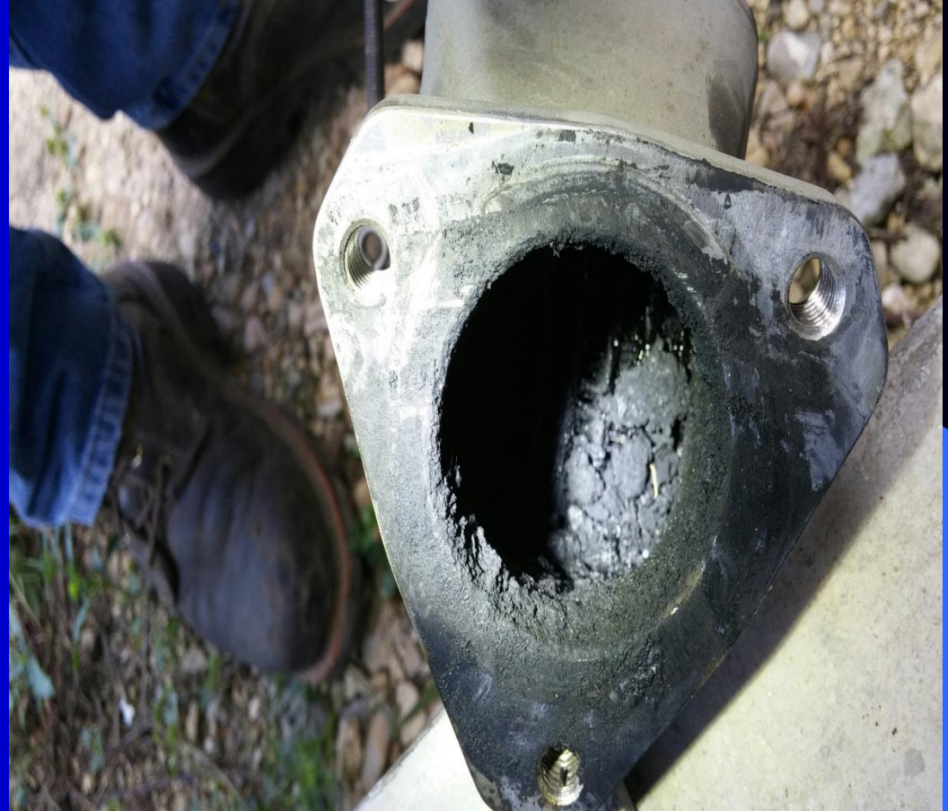
EGR Cooler with Carbon Build Up