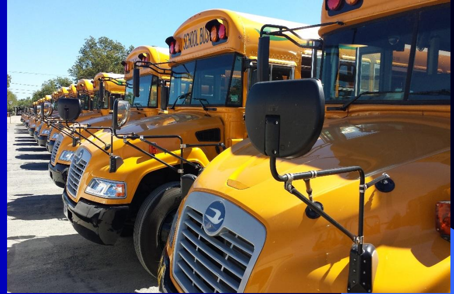
Uvalde Consolidated ISD Uvalde, Texas

Entire Fleets throughout Texas are enjoying the Benefits of using ECO-Systems and have proven to themselves the Return On Investment is measured in just a few short months. Call for references.