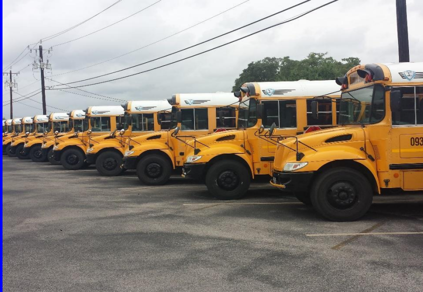
Northeast ISD San Antonio, Texas