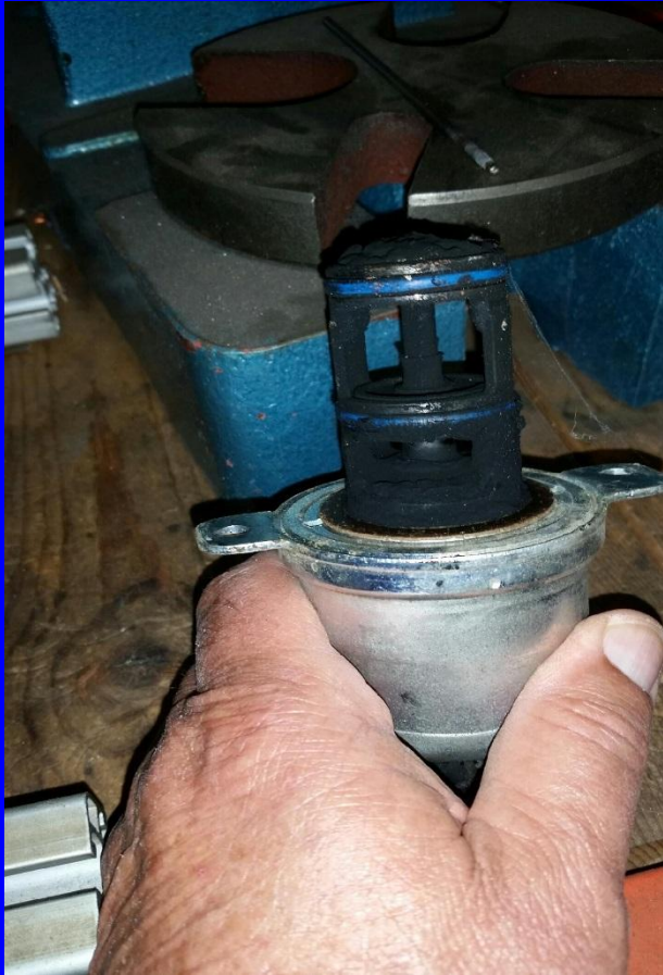
6.0 EGR Valve