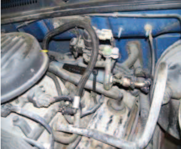
ECO #2 with 006 install kit

INST-006 5/16 Quick Disconnect: For use with all Fords 2006 and older. On all Toyotas, Nissan, KIA, Dodge, Chrysler, and Jeeps, 7.3 PowerStroke