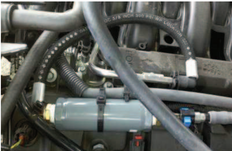
Ford 5.0 Installation at Fuel Rail

INST-005 3/8 Quick disconnect: For use on all Chevrolet, GM, and Honda model Cars with 3/8 quick disconnects at the Injection Rail, Fuel pumps or fuel filters. GM and Chevrolet Pickups with gasoline engines. 2007 and newer Fords. Dodge Hemi's, and the 6.0 Powerstroke, and 6.7 Cummins Diesel.