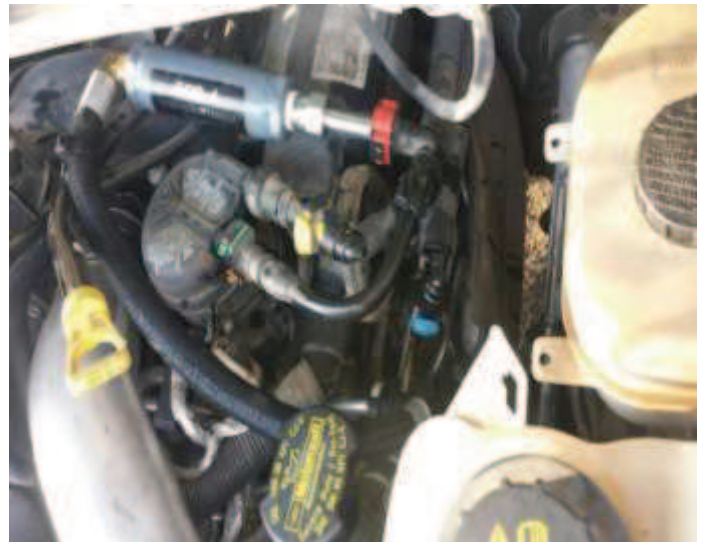
Above is a 6.4 Ford PowerStroke Installation