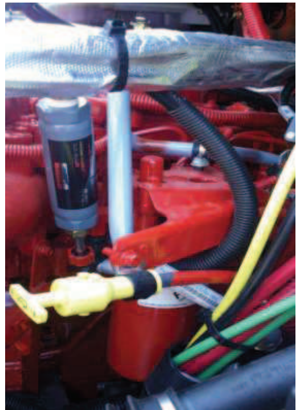
005 kit on a 6.7 Cummins Diesel