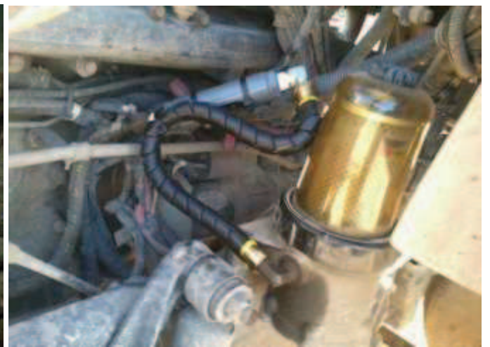
Detroit Engine with 003 Install kit