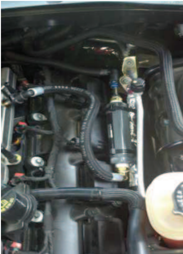
005 kit on a Dodge Hemi

The 005 Install kit is the most widely used kit by most Distributors. Here are 2 more applications with the 005 kit.