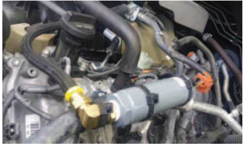
ECO #4 with 006 install kit on Toyota Tundra

INST-007 Gates quick disconnect: Ford Crown Victoria, 2009 and older Ford Pickups with 4.6L or 5.4L or 6 cylinder, Ford Mustangs, Mercury and Lincoln models.