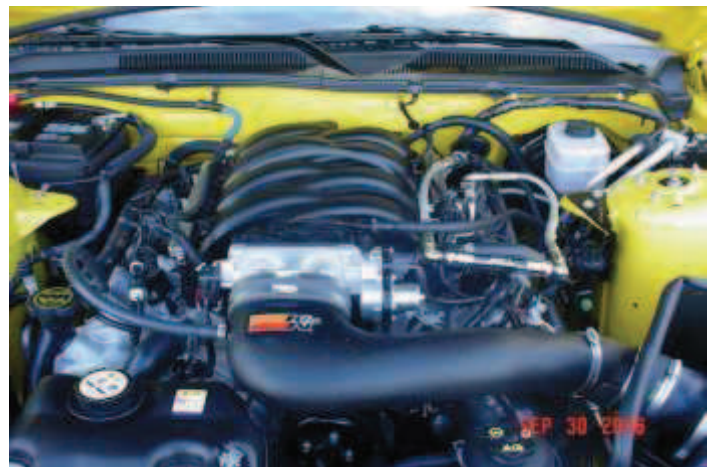
5.0 Mustang GT Installation