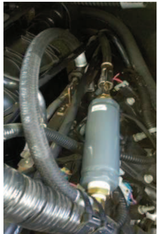
Chevrolet Installation at Fuel Rail