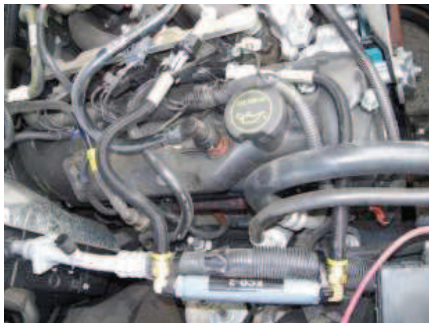
Crown Vic 4.6 installation

INST-007 Gates quick disconnect: Ford Crown Victoria, 2009 and older Ford Pickups with 4.6L or 5.4L or 6 cylinder, Ford Mustangs, Mercury and Lincoln models.